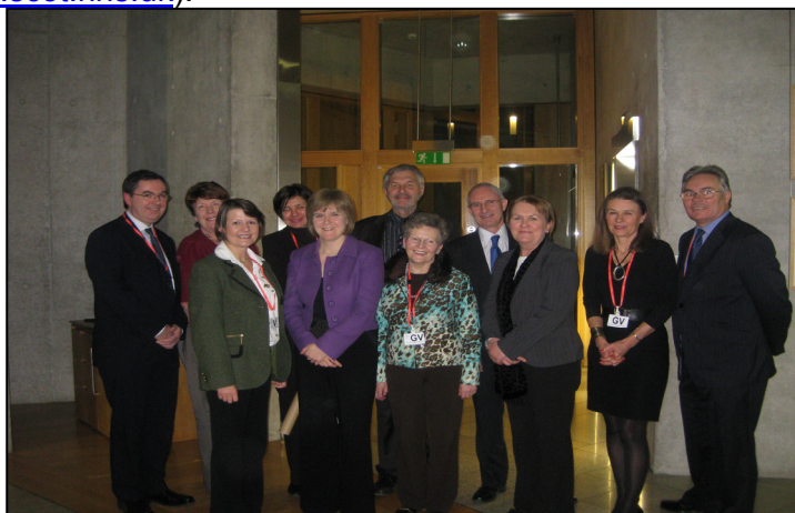
FANS network members are photographed with MSPs from the Cross Party Group

The network was launched by Ms Nicola Sturgeon MSP, Cabinet Secretary for Health & Wellbeing. Presentations from network clinicians and members of the public affected by familial arrhythmia were well received by the group. The launch was further enhanced by the completion of the FANS website ( www.fans.scot.nhs.uk ).