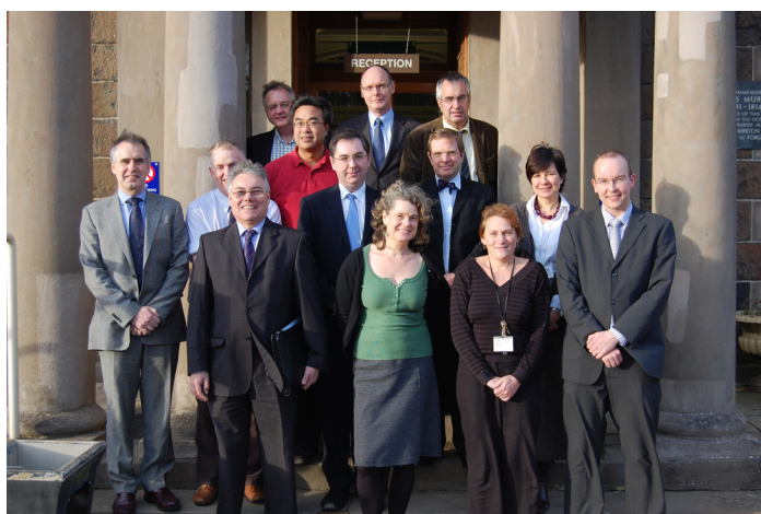
Members of the FANS Steering Group